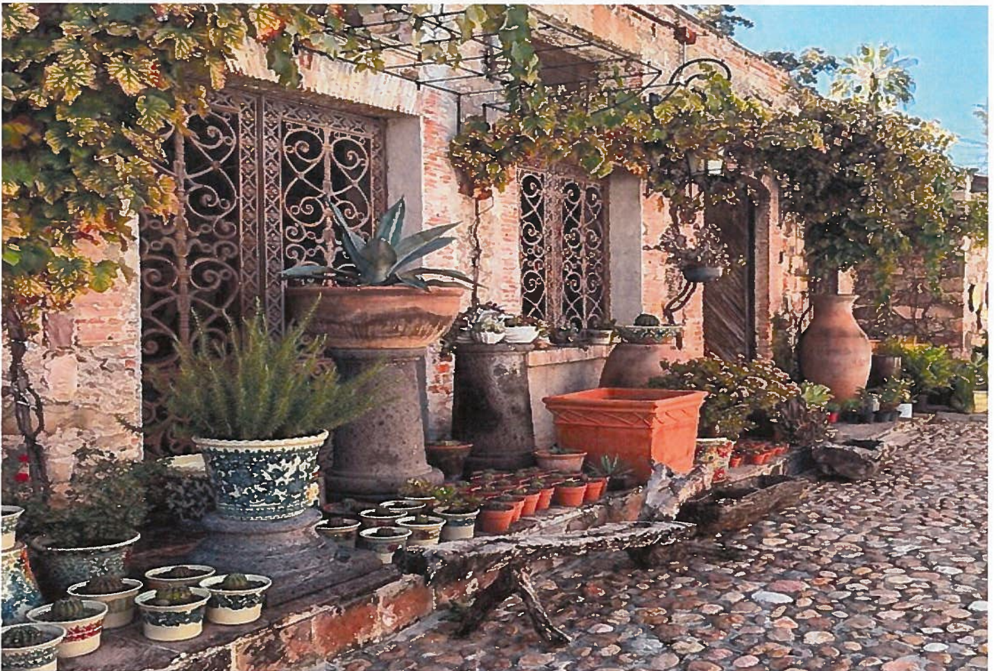
Fabrica Aurora (above photo) Once a textile factory, today is home to canvases, sculptures and artisanal craftwork made by the great artists of San Miguel.

San Miguel is a mountain town with an altitude similar to Denver. It is hilly in areas and the cobblestones require comfortable walking shoes. We will be staying in the Centro area of town near the Jardin (central garden) so our walks will be mostly flat.