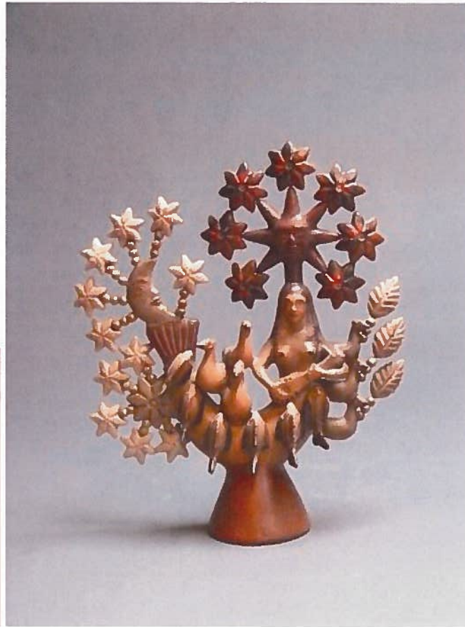
Examples of just some of the exquisite folk art pieces that can be seen at the Galleria Atotonilco .