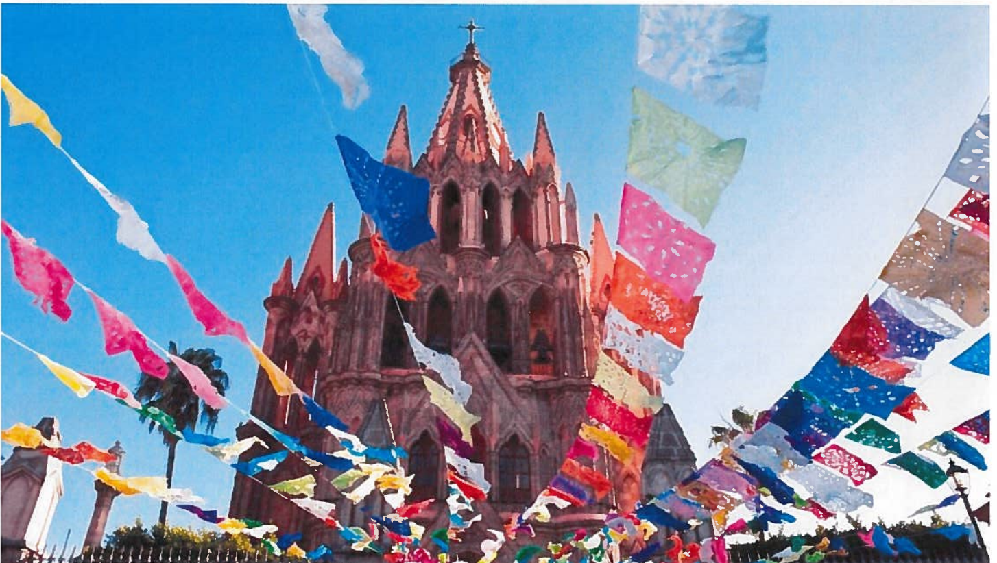
Parroquia de San Miguel Arcange – (above photo), probably the most recognizable of San Miguel's churches, dates to the 17 th century and dominates the main garden in the center of town, Jardín.