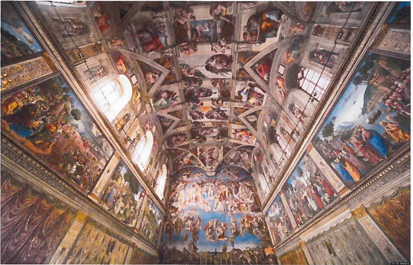
An upward view inside the Sanctuario de Atotonilco , Mexico's Sistine Chapel.